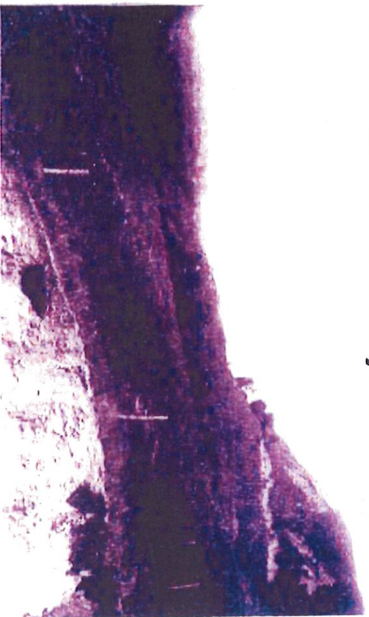
Murray Hill, Harrison County, ca. 1900