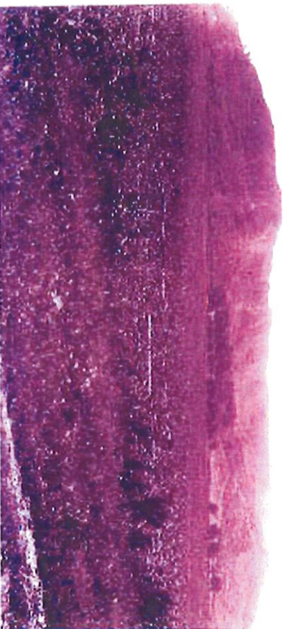
Pisgah area, Harrison County, ca. 1900