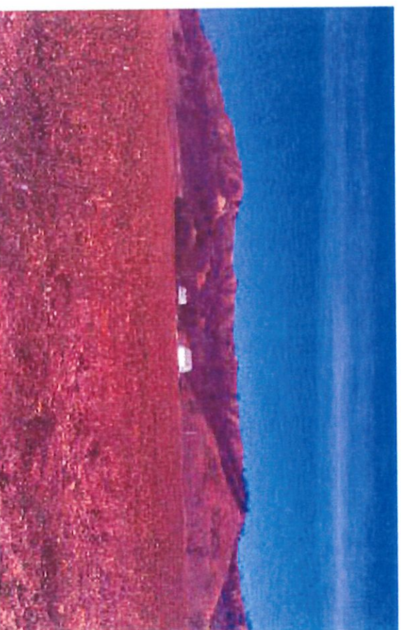
Pisgah area, Harrison County, March 2005