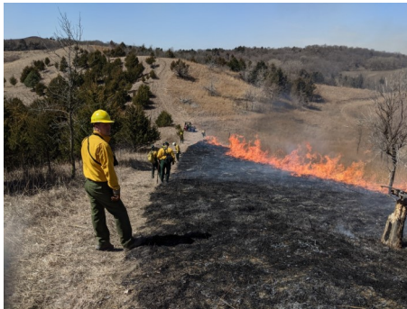
Lighting fire off of a mowed firebreak on a prescribed burn in the Loess Hills. I was tasked with taking up the rear to patrol the fireline and monitor weather conditions for the burn.

I am a passionate proponent of using fire to manage our natural systems. That passion causes my professional life to often bleed over into my personal life, with (mostly) positive results. Part of my job is to advise producers on how to safely and effectively implement fire on their conservation plantings. I strongly feel that, in order to do that effectively, one has to also be a fire practitioner themselves. Every year, I use a significant portion of my free time from work to engage in fire activities, on the prescribed fire side with local conservation groups and on the wildfire side through volunteering with my local fire department. This helps me deliver sound advice to producers and create better conservation products, while also allowing me to grow as a conservation professional.