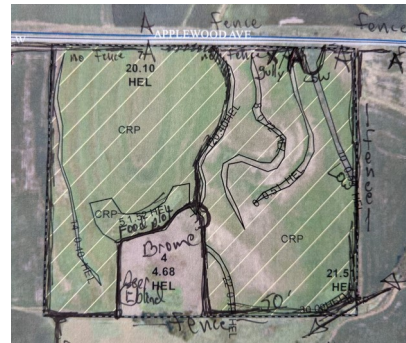
My chicken-scratch field notes for planning a burn. Planning informed by real-world experience helps ensure I'm planning safe and effective prescribed fire.