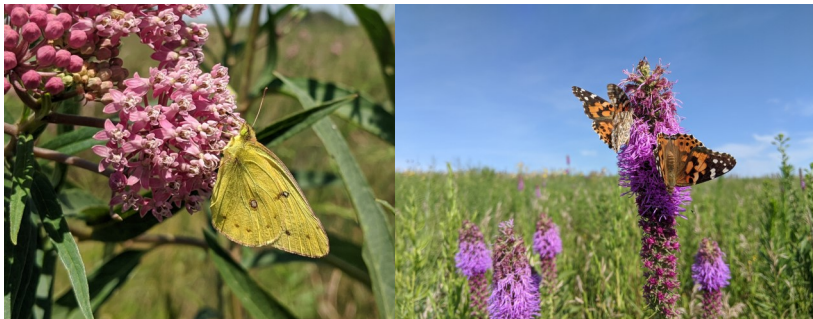
Obligatory butterfly pictures from the field: (Left) Clouded Sulphur on swamp milkweed in Pottawattamie County and (Right) Painted Ladies on prairie blazingstar in Harrison County.