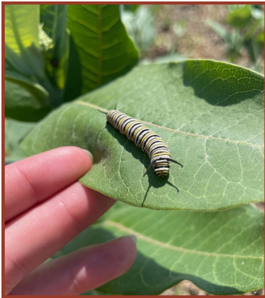
Monarch Butterfly caterpillar on a common milkweed leaf in CRP (June 6)

I was able to include a Wildlife plan map from a farm being managed for upland birds with a pollinator seeding. pollinator seeding in both of these plans, serving as nesting or brood rearing cover for quail and pheasant. Though these pollinator seedings are only a small portion of the entire project, they make a big difference when it comes to the overall health and population of pollinators. Thank you all for your continued support, and keep talking about pollinators!